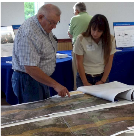
Constitution representatives continue to meet with landowners to further refine the pipeline route.

"It's important for us to emphasize that we're still out there talking with property owners and making adjustments to the route to accommodate them where practical. This