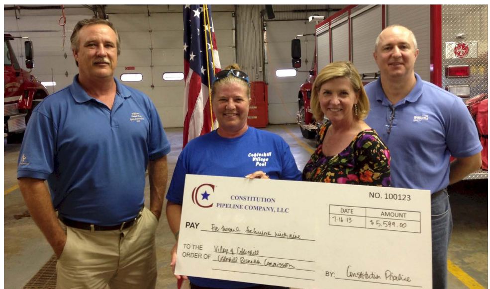
Constitution Pipeline representatives present a check to the Cobleskill Recreation Commission.

The mission of the Constitution Pipeline Community Grant Program is to identify and help fund noteworthy projects that directly benefit the surrounding communities.